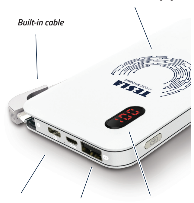
USB 5V 2.4A LED indicator Support 2.1A current input USB output type-C/micro usb